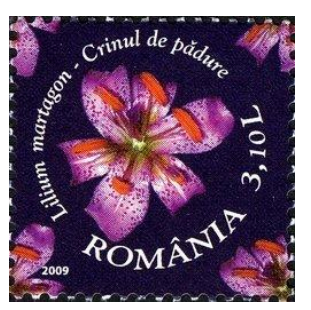
(f) Lilium martagon

Fig. 3. Stamps of the "Flora from protected areas - Rodna Mountains" issue, March 28, 2009, Bucharest