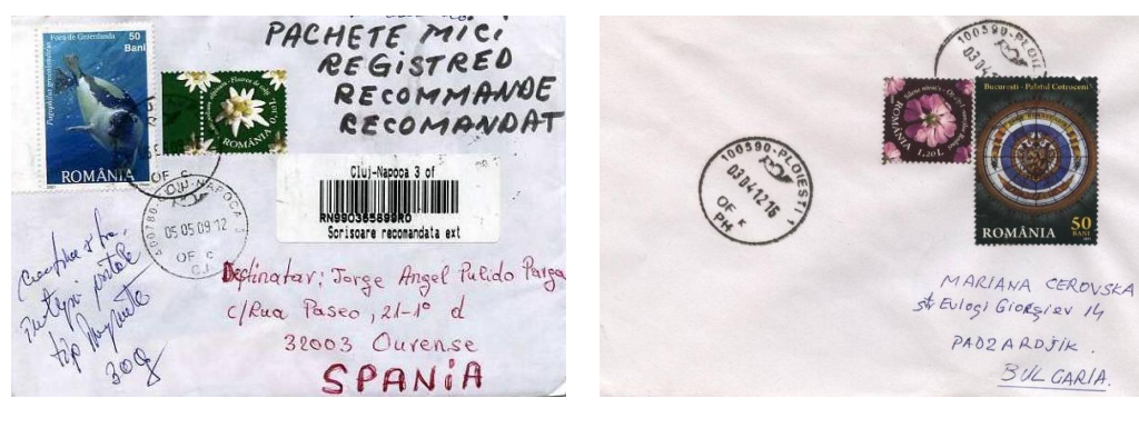
(a) Leontopodium alpinum