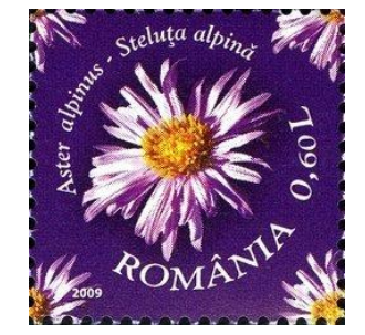
(b) Aster alpinus