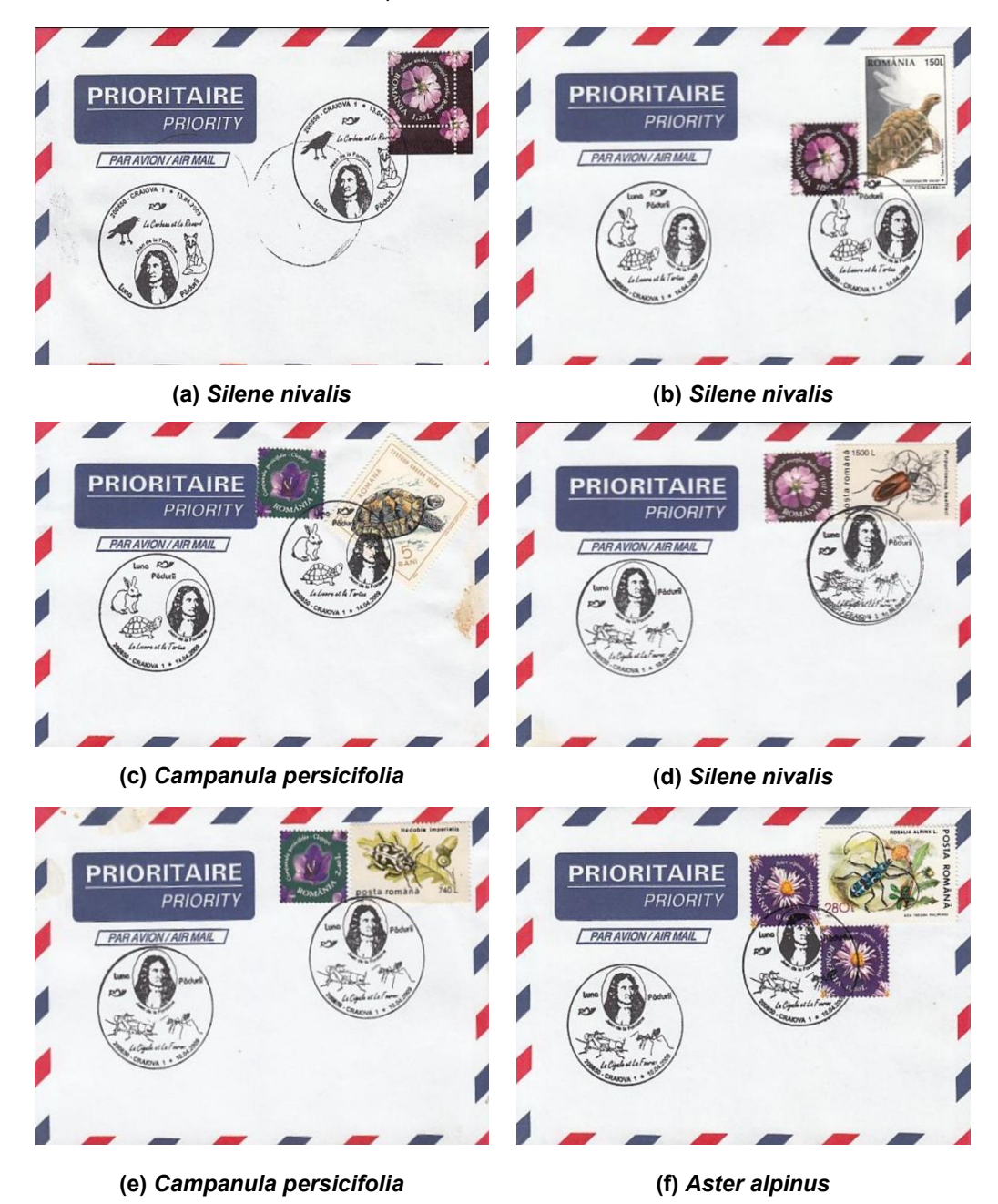
Fig. 6. Circulations of the "Flora from protected areas - Rodna Mountains" issue

especially Delcampe and PicClick, are mostly circulated primarily "by plane/air mail" (Fig. 6), or some even circulated on the relationship with foreign countries, to countries such as Spain, Bulgaria, Estonia and Denmark (see Fig. 7). The pieces in question, as expected, required additional stamps for postage, from completely different philatelic issues in use at the time.