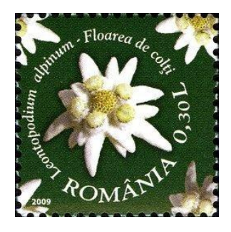
(a) Leontopodium alpinum