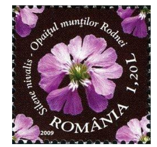
(d) Silene nivalis