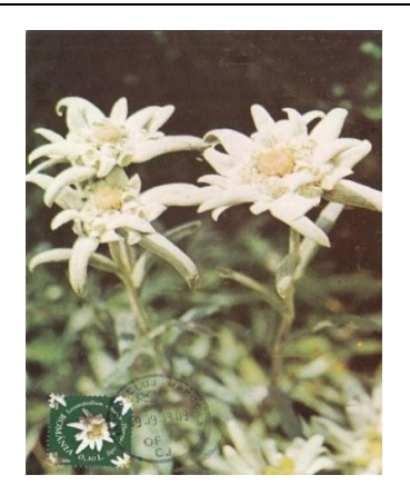
(a) Leontopodium alpinum