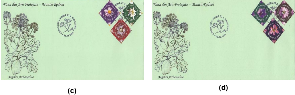
Fig. 4. FDCs of the "Flora from protected areas - Rodna Mountains" issue, March 28, 2009, Bucharest