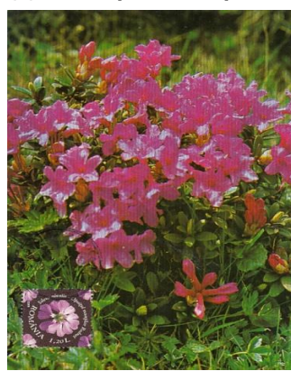
(d) Silene nivalis