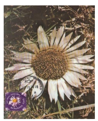
(b) Aster alpinus