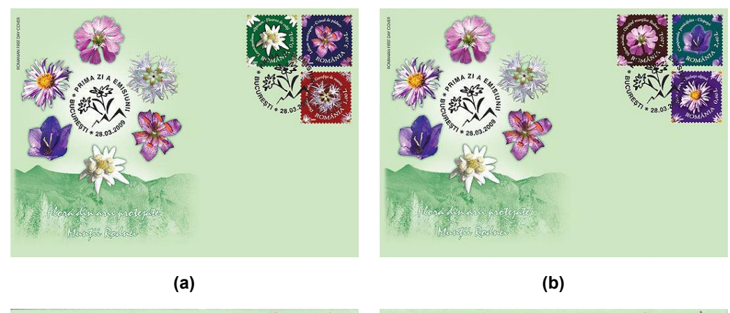
Fig. 3. Stamps of the "Flora from protected areas - Rodna Mountains" issue, March 28, 2009, Bucharest