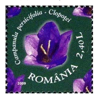
(e) Campanula persicifolia