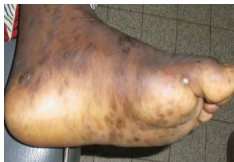
Figure 1. Kaposi's lymphangit of the left foot.

The blood count showed anemia with hemoglobin regenerative microcytic hypochromic 7 g/dl, the white count was 8 gigabytes per liter, predominantly neutrophils 60%. The chest radiograph was normal transaminases