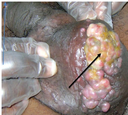
Figure 3. Nodular lesions of Kaposi.