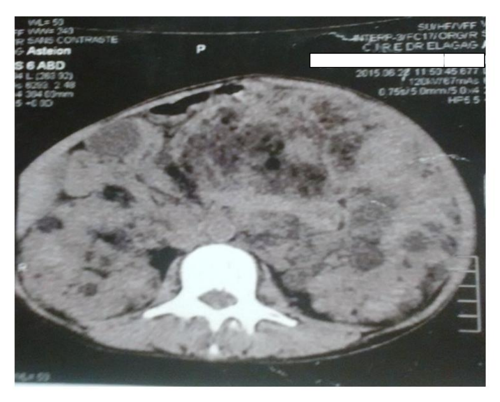
Figs. 2 and 3. Abdominal scan showing giant bilateral angiomyolipoma

Benatta Mahmoud; AJRID, 8(4): 17-21, 2021; Article no.AJRID.72959