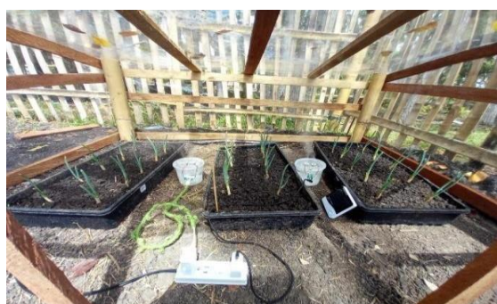
Fig. 1. Set-up of humidifiers inside the mini-greenhouse

well-equipped school provided a stable and secured environment for the spring onions to be planted, with sufficient sunlight exposure and rich loam soil nutrient. This study used a quantitative research approach and the pre-grown spring onions were planted and grown inside the mini greenhouse with a humidifier and in the open field. The structure of the mini greenhouse is composed of bamboo, coco lumber, and transparent plastic cover. Four (4) bamboos were used as pillars to ensure the stability and support of the mini greenhouse. Another support added is the coco lumbers that served as the foundation of the mini greenhouse. To enclose, transparent plastic covers are wrapped around the sides of the mini greenhouse to control the humidity inside. The mini greenhouse has an approximate size of 6ft x 4ft x 5ft. In contrast, the open field set up is directly exposed to the open environment and considered as the traditional method of planting. Both of the growth environments have 3 plant boxes sized containing 10 plants each.