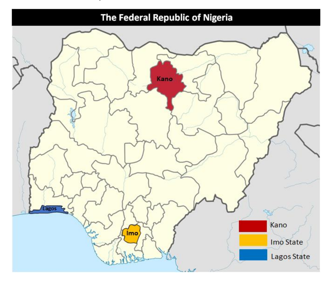
Fig. 1. Locations of the study

Statistical Package for Social Science Version (SPSS) 20 was used to analyze the final data. Descriptive, parametric (ANOVA), non-parametric (Chi-square) statistics were used in the analysis of the data and testing of the null hypothesis. Test for significance was set at a p-value of 0.05.