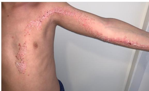
Fig. 1a. Linear psoriasis is seen on the trunk, shoulders, arms, and forearms

The patient was a 7-year-old child with no significant medical history who had been experiencing erythematous and scaly lesions on the left hemi body for 3 years. The lesions were slightly pruritic and presented as small, linear patches. They affected the trunk, shoulder, arms, forearms, leg, third and fourth toes, and the sole of the left foot. Clinical examination revealed the presence of characteristic signs of psoriasis, such as the candle sign and bloody dew, as well as onycholysis and a saw-toothed appearance of the nails (Fig. 1). A skin biopsy was performed and showed parakeratosis, Munro micro abscesses, hypogranulosis, and papillomatosis (Fig. 2). Based on the clinical and histological findings, two diagnoses were considered: PBL and ILVEN. To determine the correct diagnosis, the patient was treated with white petroleum jelly and salicylic acid petroleum jelly 5%, which resulted in a significant improvement of the lesions and confirmed the diagnosis of PBL.