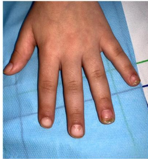
Fig. 1d. Characteristic signs of psoriasis, including the candle sign, bloody dew, onycholysis, and a saw-toothed nail appearance, are also visible

systemic medications can be used in the case of PBL. It is important to select the most appropriate treatment based on the severity of the lesions, the location, and the patient's tolerance, and to keep in mind that PBL can have long-term effects on the quality of life of patients and their families [4].