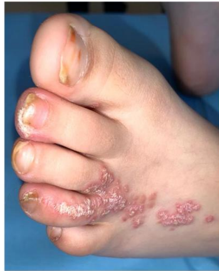
Fig. 1b. Linear psoriasis is present on the third and fourth toes, as well as the sole of the left foot