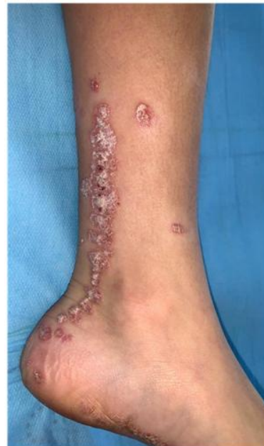
Fig. 1c. The leg displays linear psoriasis