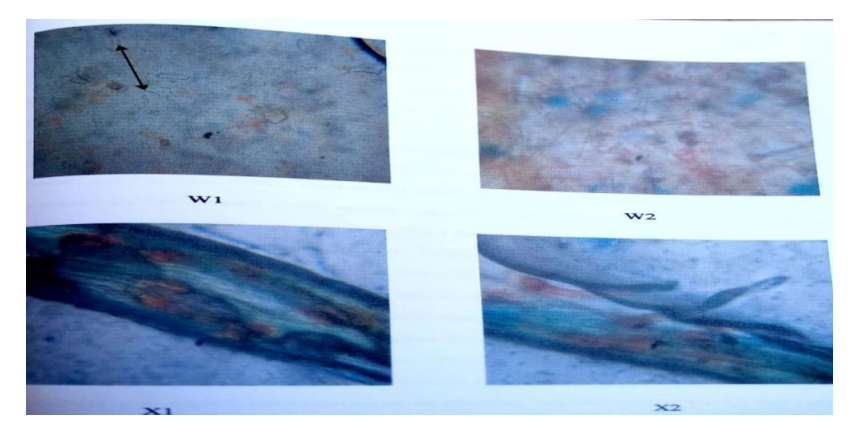
W1 = TCg 1 (Diacytic); W2 = TCg 4 (Paracytic); X1 = TPtu 1 (Diacytic); X2 = TPtu 5 (Diacytic)

3= Paracytic stomata, 4= Diacytic stomata, 5= Irregular cell shape, 6= Polygonal cell shape, 7= Slightly straight anticlinal wall, Curved anticlinal wall, 9= Curved/slightly straight anticlinal wall