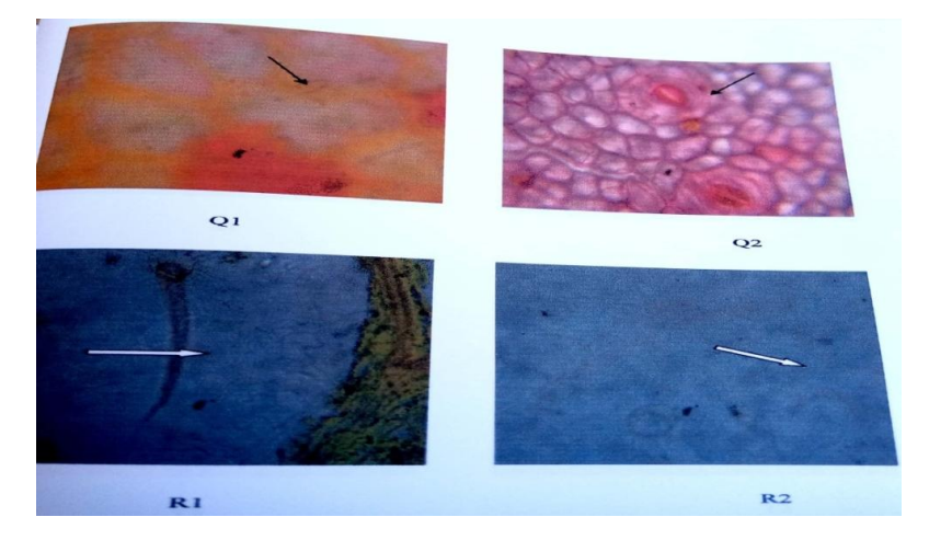
Q1 = TKg 6 (Paracytic); R1 = TCc 8127 (Anomocytic); Q2 = TKg 12 (Paracytic); R2 = TCc 8156 (Paracytic)