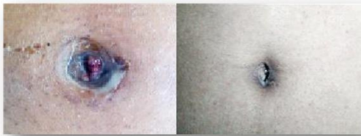
Fig. 1. Pre operative appearance: Clinical diagnostic but in our case could not see the hairs

The second patient, a 58 year old man presented with pain and swelling in the umbilical region and pus discharge since 1 week. Patient was a known diabetic well controlled on regular antidiabetic medications. Patient had history of suture repair of an Umbilical hernia 25 years back but detailed history was not available. Ultrasound was done to rule out presence of mesh as no notes were available. It confirmed no mesh or any intrabdominal collection.