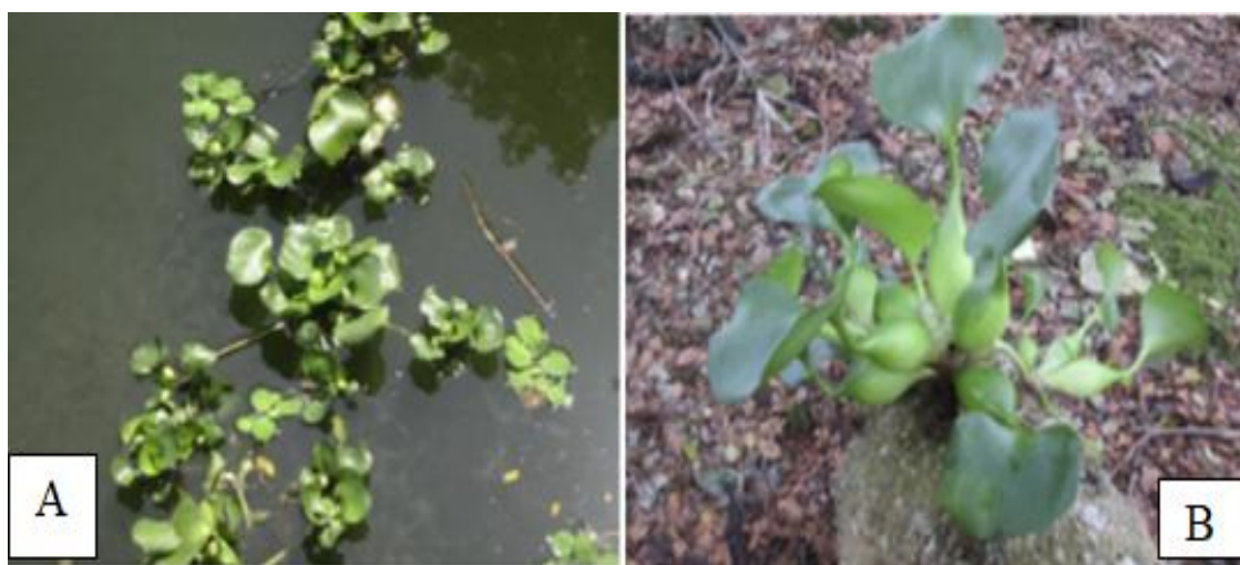
Fig. 1. (A) Floating E. crassipes . (B) Bulb/Rhizome

It is an established fact that the impact of infestation as invasion of Water Hyacinth (WH) in fresh waters has negatively impacted both social and economic aspect of society [32]. These effects are evident in areas of fishing folk activities, resident community public health - malaria outbreak resulting from mosquito breeding-, electrical power supplies (cables and pipelines), maritime activities (cargo and war ships, navigators, boats, vessels), and water supply chains and lost sites for recreation and