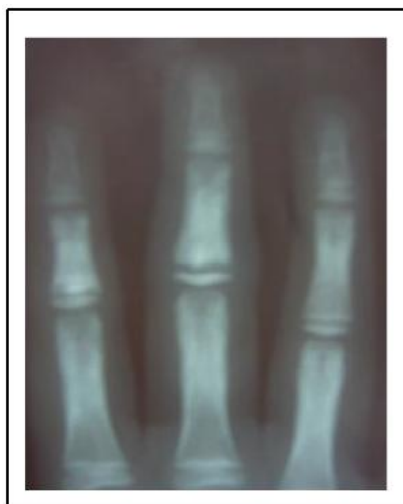
Fig. 4. X-rays after 6 months, showing reconstruction of the bone compared to the other fingers

It was formerly known as “Histiocytosis X”, which was regrouping three major variants of the same disease: If the lesion is unifocal with a solitary bone lesion, we are talking about eosinophilic granuloma. If we have multifocal LCH with the classic triad of skull lesions, exophthalmos and diabetes insipidus, it is known as the Hand-Schüller-Christian disease. If we have fulminant LCH with multiple organ involvement, it is known as the Letterer-Siwe disease [1]. This old terminology is now replaced by a classification that is based on the site of lesions, number of involved sites and whether the disease involves risk organs (hematopoietic system, liver, or spleen) [2].