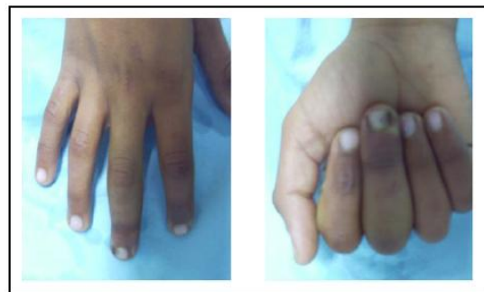
Fig. 3. Clinical examination after 6 months

The evolution was good with disappearance of the pain and the swelling within 3 weeks (Fig. 3). In 6 months, there was a complete bone reconstruction of the 2 nd phalanx of the 4 th right finger (Fig. 4). The patient had a consultation with a referred pediatrician who eliminated the localization of any other abnormality.