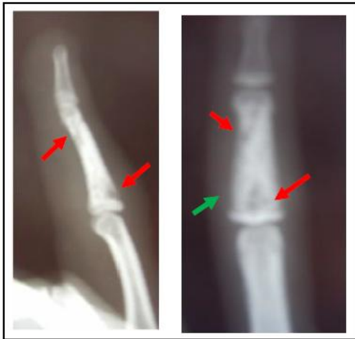
Fig. 1. X-rays showing the lesions - Red arrows: Osteolytic lesions - Green arrow: Periosteal reaction

The X-ray of the hand (Fig. 1) showed multiple osteolytic lesions of the metaphysis and diaphysis of the 2 nd phalanx of the 4 th right finger. Articular cartilage was respected. There was also a periosteal reaction. Thoracic X-ray was normal.