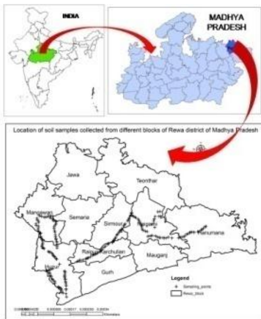
Fig. 1. Location map of study area

categories (low, medium and high) as suggested by [7].