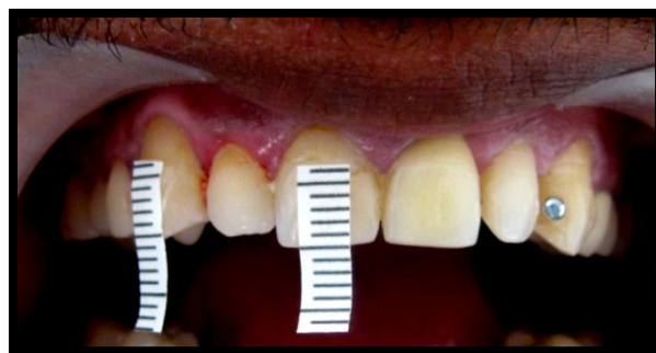
Fig. 2. Sticking the adhesive tape with millimeter markings on labial surface of the right central incisor. The centimeter marking line correlated at the level of incisal edge of maxillary central incisor & the tip of maxillary canine