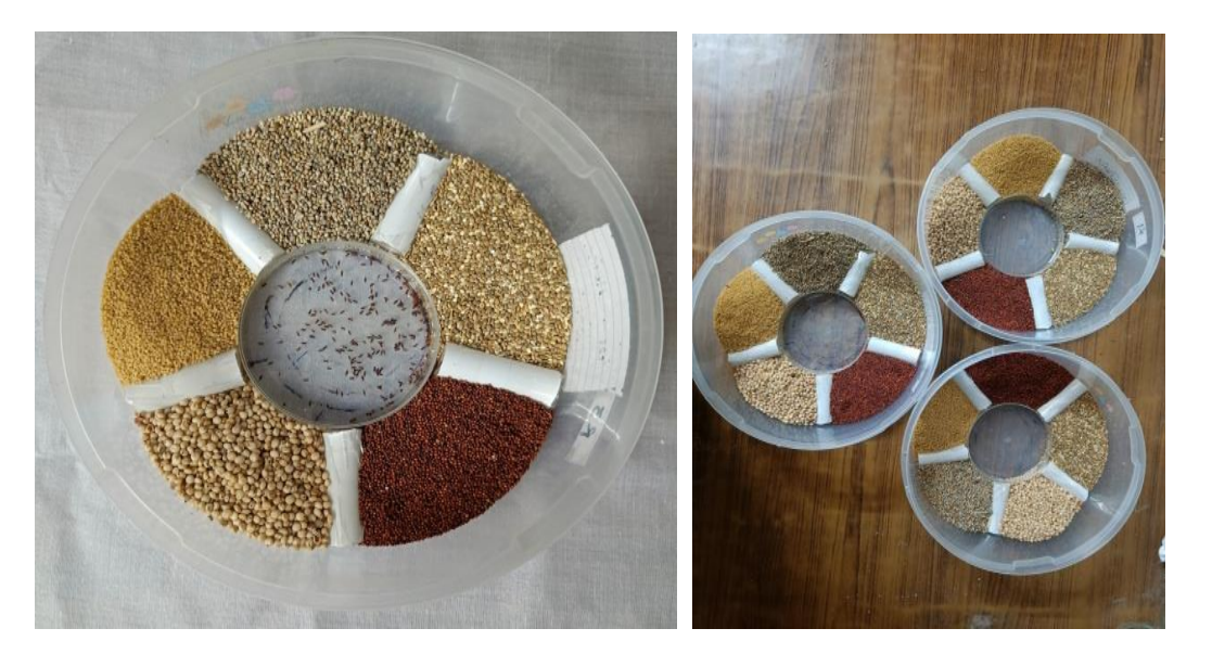
Plate 1. Layout for Host preference