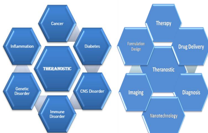
Fig. 1. Theranostic platform and applications in various disease and disorders

Theranostics nanoparticles are mainly composed of polymeric, lipid based and metallic nanomaterials such as, organic and inorganic materials, nano capsules, micelles, liposomes, dendrimers, quantum dots, and carbon nanotubes as depicted in Fig. 2.