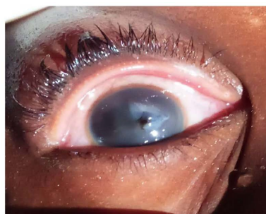
Figure 2. Ulcère central post-traumatique OG.

Patient 9 years old; Student; resident in Dubréka Complaints (OD sand projection, OD pain, OD AVB) Progression: 24H Diagnosis CEIO with corneal entrance hole and iris hernia Treatment Extraction of CE, suture of the wound, reintegration of the iris, antibiotic therapy, analgesic