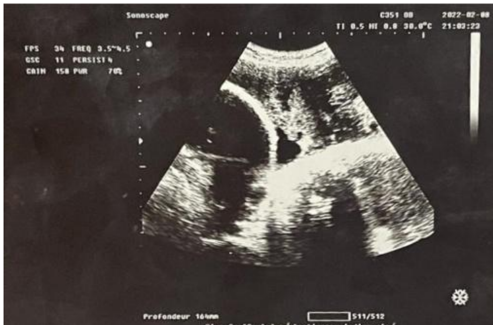
Fig. 2. Ultrasound image of the patient's low inserted anterior placenta