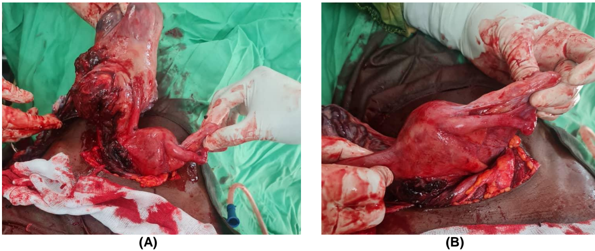
Fig. 3 (A-B). Macroscopic aspect of the rudimentary horn and the normal horn after fetal extraction