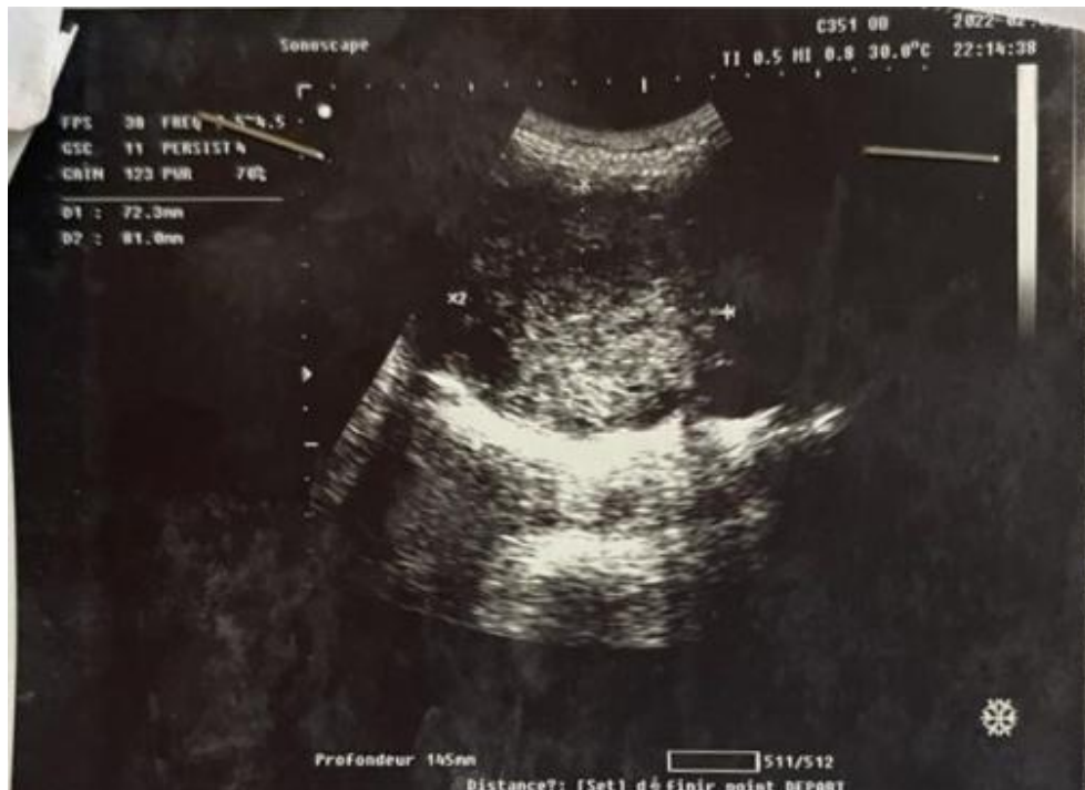
Fig. 1. Ultrasound image of the praevia mass