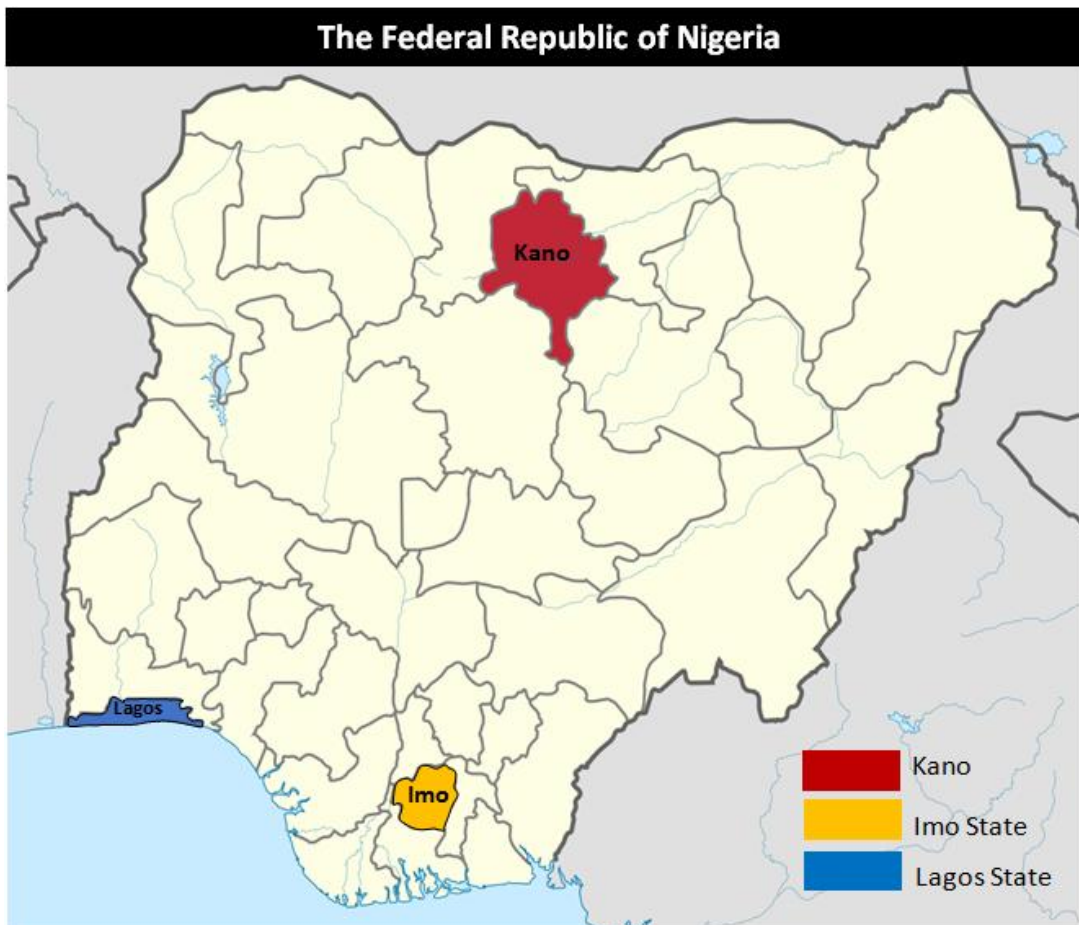
Fig. 1. Locations of the study

Statistical Package for Social Science Version (SPSS) 20 was used to analyze the final data. Descriptive, parametric (ANOVA), non-parametric (Chi-square) statistics were used in the analysis of the data and testing of the null hypothesis. Test for significance was set at a p-value of 0.05.