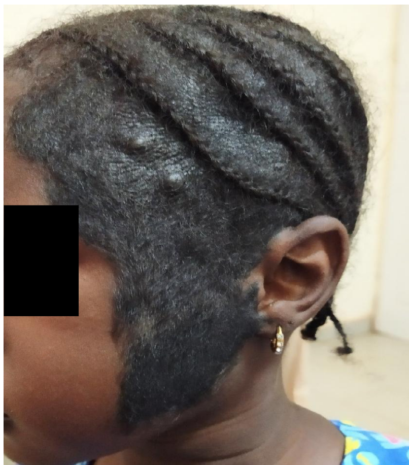
Fig. 1. Large hyperpigmented hairy nevus on the face extending to the scalp with two discrete proliferative nodules on the left temporal region

back, the gluteal region and the thighs with small, discrete, non-hairy hyperpigmented lesions measuring 0.5-1.0 cm in diameter. There was no dysmorphic features, no significant peripheral lymphadenopathy, the neurologic and other systemic examinations were normal. A clinical diagnosis of large congenital melanocytic hairy nevus with multiple satellite nevi was made. Her results of complete blood count, Hepatitis B and C profile, retroviral screening, electrolytes, blood urea nitrogen, and blood sugar were essentially normal. Electroencephalographic findings revealed no seizure activity. Computed tomography scan of the brain showed normal findings. Histology report of the biopsied skin lesion (Fig. 4) revealed fairly discrete aggregates of small nests of pigmented polygonal melanocytes, melanophages and small naevoid cells in the dermis, consistent with melanocytic nevi.