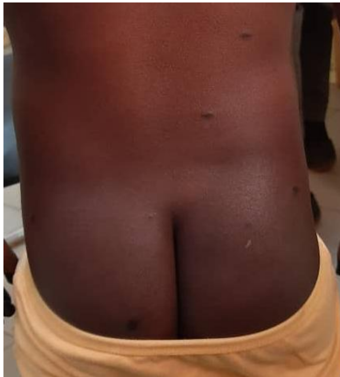
Fig. 3. Satellite non hairy nevi on the lower back and gluteal region