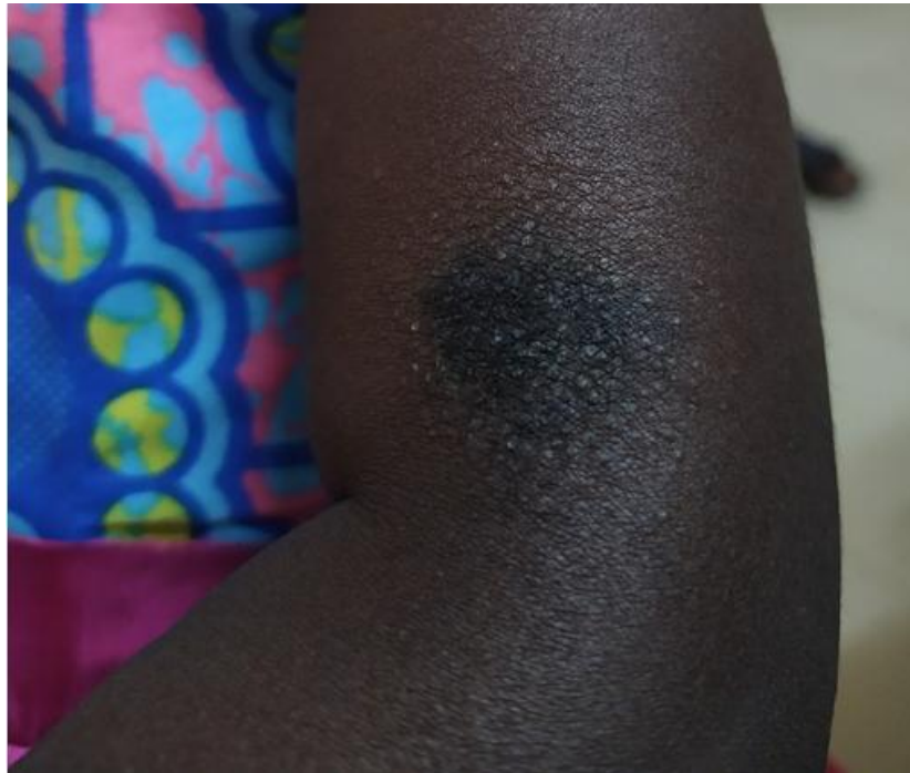
Fig. 2. Hairy nevus on the lower one-third of the left arm