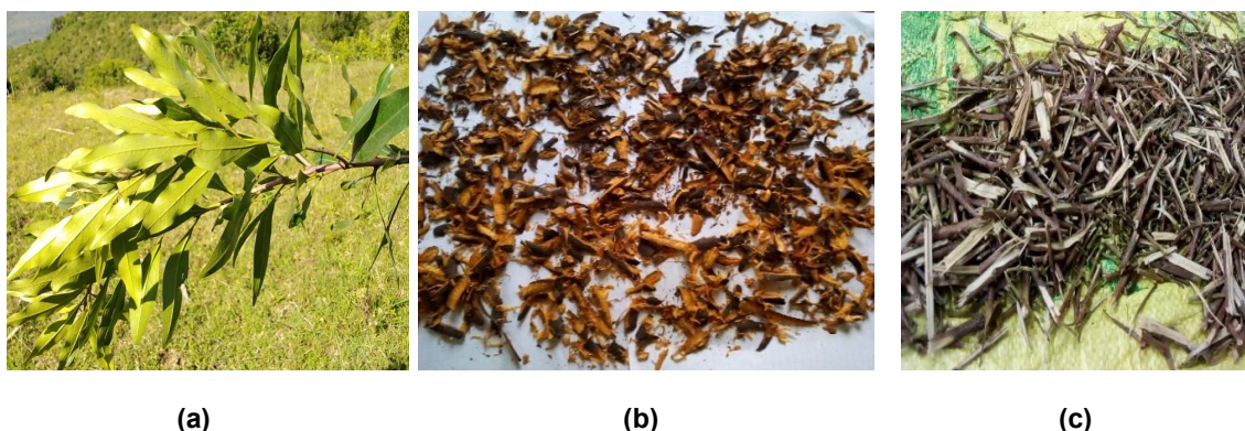
Fig. 1. Fresh samples of E. divinorum (a) leaves, (b) root barks and (c) tender stems

The antimicrobial activity of the extracts was assessed using disk diffusion method with surface plating to check the efficacy of the plant extracts against four microorganisms namely: Streptococcus pyogenes ATCC 19615, Staphylococcus aureus ATCC 25923, Candida albicans and Escherichia coli ATCC 25922. The microbes were obtained from Egerton University Microbiology Laboratory, Nakuru, Kenya. The