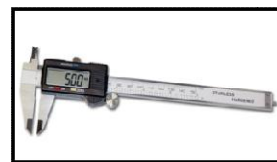
Fig. 1. Digital vernier caliper

Instruments: Digital Vernier caliper. (Fig. 1).