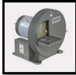
Fig. 6. Cast trimmer