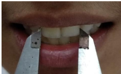
Fig. 8. Measuring combined central incisor width with digital Vernier Caliper

Patients were seated in upright position and lips lightly touching each other. It was ensured that lip was completely in relaxed position. Two most prominent points were marked at base of philtrum. These points were marked by drawing a line along the vertical ridge of philtrum and marking a point where they meet the vermilion border of upper lip. Radiographic pen (0.4 mm) was used to mark these lines and points. The width between these two points was measured