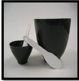
Fig. 5. Rubber bowl and spatula