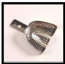
Fig. 2. Maxillary perforated dentulous metal stock tray

Materials: Maxillary perforated dentulous metal stock tray of varying sizes, Rubber bowl (flexible) and curved spatula, Rubber bowl and plaster spatula, Base former, Cast trimmer Point marker, Type III Dental stone (Kalabhai) (Fig. 2, 3, 4, 5).