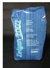
Fig. 3. Alginate – zelgan