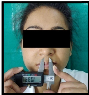
Fig. 7. Measuring philtrum width with vernier caliper