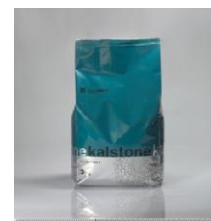
Fig. 4. Dental stone type iii