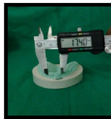
Fig. 9. Measuring the width of central incisors with digital Vernier Caliper on model

All tabulated data was send for statistical analysis. Chi-square test was used to compare categorical variables. The Unpaired t-test was used to compare continuous variables. Pearson correlation coefficient was calculated. The p-value<0.05 was considered significant. All the analysis was carried out on SPSS 16.0 version (Chicago, Inc., USA).